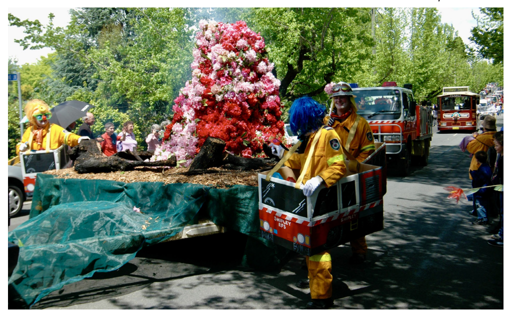
Photo: A creative Shipley RFS float in the parade a few years ago as we were gearing up for the fire season